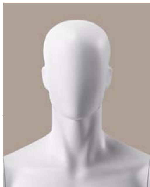
MH417 STANDARD INCLUDED