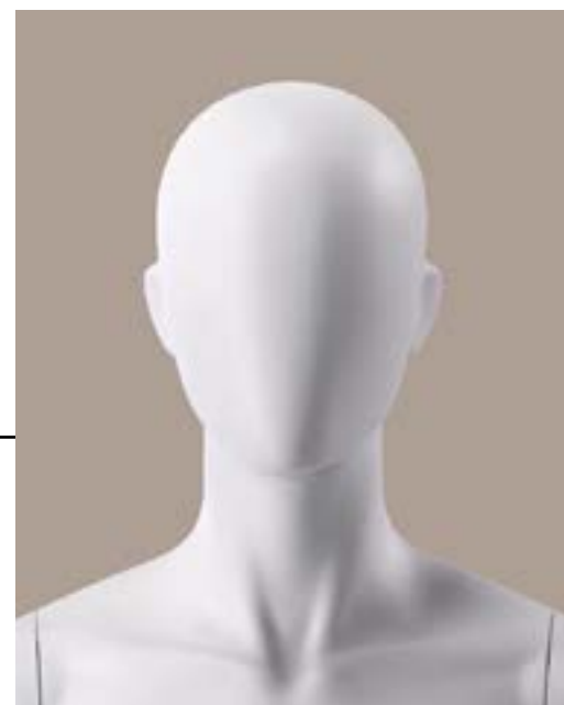
FH094 STANDARD INCLUDED