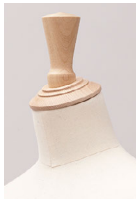
NEC05 FRENCH NECK AND FINIAL