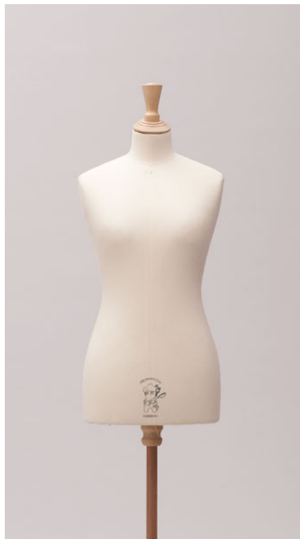
9028 | GIRL

Our classic girl-shape bust form is available in four sizes between 2-14 years and can be used for all types of garments.