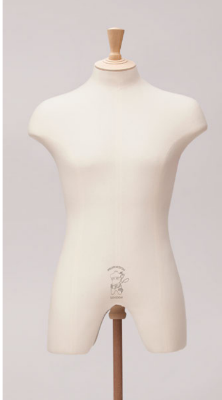
BUS03 | PREPPY

This preppy-inspired mannequin sports a broader chest and larger build to accentuate form-fitting clothing, such as t-shirts.