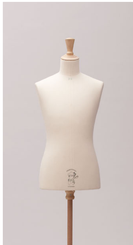
9080 | BOY

Our classic boy-shape bust form is available in five sizes between 6-15 years and can be used for all types of garments.