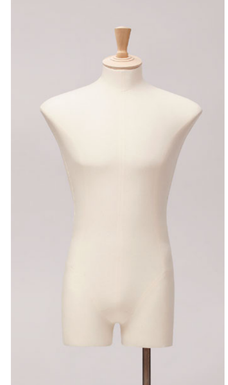
BUS07 | SOPHISTICATED

A slender and sophisticated bust form with a small chest makes this shape ideal for high fashion and slim-fitting garments.