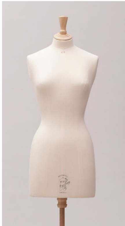
9015 | CONTINENTAL

A leaner, slenderer version of our 'British' bust form has the perfect proportions for high fashion and VM display .