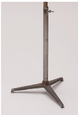
BAM02 CAST IRON TRIPOD BASE