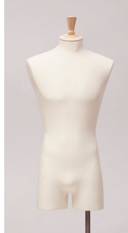
BUS05 | CASUAL

This unique shape featuring slim hips and a small bottom was specifically created for drop-crotch denim and trousers.