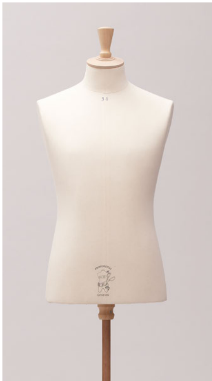
9050 | BRITISH

Our classic bust form shape is ideal for VM display , having an aristocratic build and full chest that is ideal for formal tailoring and more mature clothing.