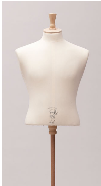
6000 | BODY CONSCIOUS

A muscular physique featuring a heavily built chest makes this bust form a great choice for form-fitting gym apparel .