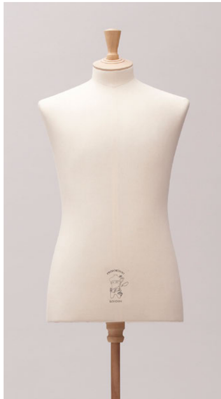
9060 | CONTINENTAL

This fashion-forward bust form shape has a lean, svelte body with a flatter chest that's ideal for young, casual fashion.