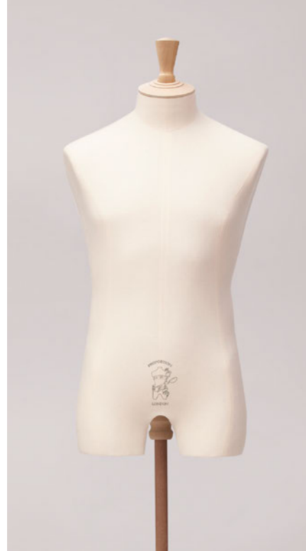
BUS04 | CLASSIC

A block-shaped bust form with a low waist to hip ratio and slanted shoulders make this classic shape the perfect choice for tailoring .