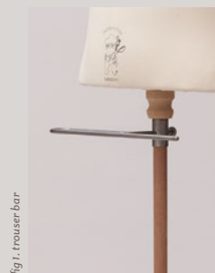
fig 1. trouser bar

Our traditional tailoring system features a neck cap and wooden bust runner mechanism which ensures ease of work, allowing full rotation of the form whilst tailoring a garment.