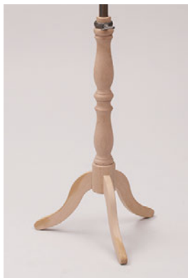
BAW05 WOODEN TRIPOD BASE