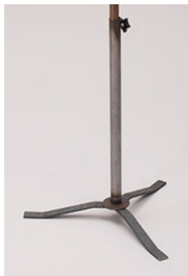
BAM03 WORKROOM TRIPOD BASE