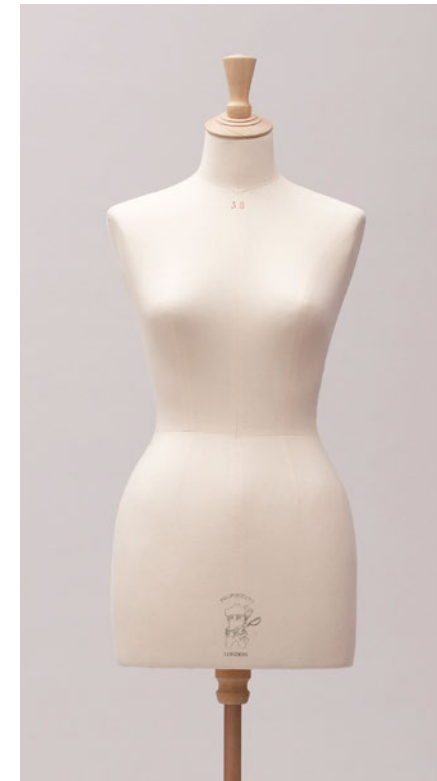
9025 | HOURGLASS

Our curviest shape , with a narrow waist and generous hip has the perfect proportions to display structured clothing .