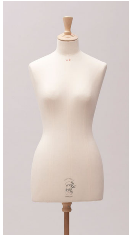
9020 | FRENCH

Generous on the waist and hip, this shapely bustform series also features a natural bustline so works well with jackets, suiting and tailored items.