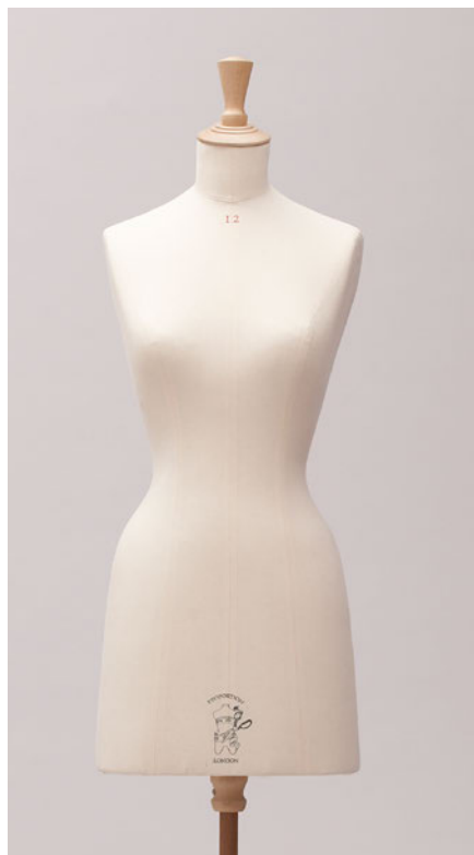
9030 | FLARED SKIRT

This shapely bust form has a large waist-to-hip ratio to accommodate skirts, dresses, eveningwear and other flared garments .