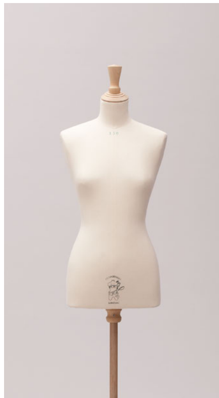
9018 | SLIM GIRL

A slimmer, shapelier take on our classic girl has a larger waist-to-hip ratio to create a more feminine look that is ideal for dresses .