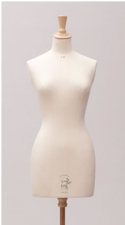
9010 | BRITISH

Our best-selling bust form has evenly distributed proportions that suit most garments, making it our most popular choice for VM display .